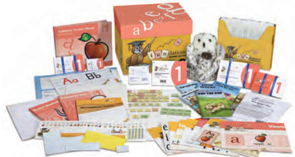
Teacher's Kits are available for all Levels (Level 1 shown)

Student Materials: Student manipulatives provide multisensory, interactive opportunities that engage students in the "fun" of building a foundation. Kits include Dry Erase Writing Tablets, Letter Tiles and Letter Boards, Student Notebooks, Student Composition Books, and Desk Strips.